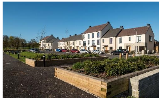
St. Modwen Homes - Locking Parklands